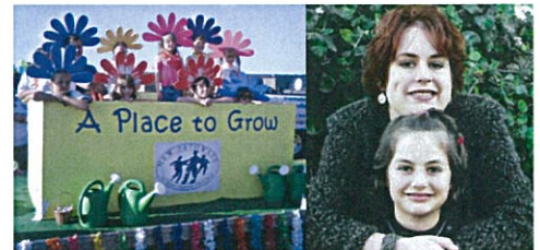
Cambridge Site IHN Where Our Families Came From